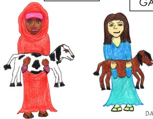
GIRLS AND GOATS