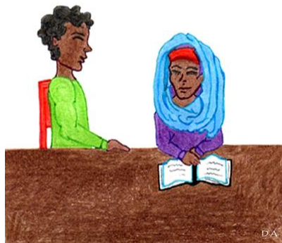
a reading teacher