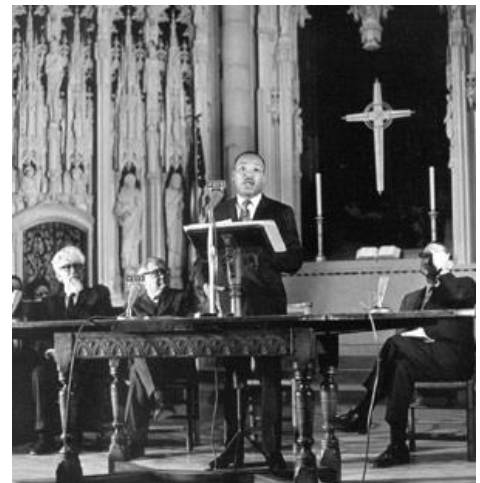
He was a preacher like his father.

When Martin grew up, he was a preacher like his father. He helped people understand that all people are important. He was teaching people to talk, not fight, to fix problems.