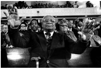
His father was a preacher.

Daddy King was a preacher in the church. He wanted his children to be good. But Martin was not good all the time. Sometimes he got in big trouble with his father.