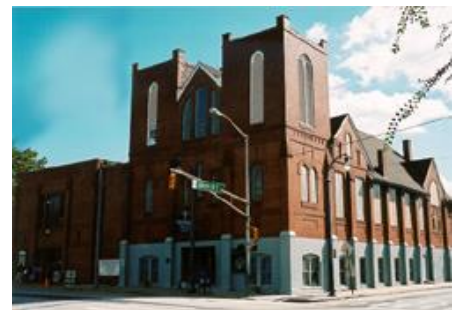
Every Sunday he walked to church

Every Sunday Martin and his family put on good clothes. They walked to church. His father preached. The people prayed and sang songs.