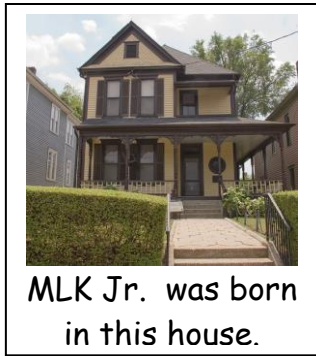
MLK Jr. was born in this house.

Almost 100 years ago on a cold winter day, Martin Luther King Jr. was born. Mother and father were so happy. His grandmother loved him.